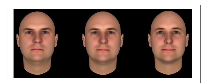
FIGURE 2 | Faces were paired with vignettes in Experiment 2, matching the condition to enhance the manipulation of trust. Faces varied in trustworthiness from untrustworthy (left), neutral (middle), to trustworthy (right). A total of three different faces were used, each with untrustworthy, neutral, and trustworthy versions, yielding nine different faces overall.

Trust manipulated in the absence of reward, between subjects, influenced participants' willingness to delay gratification, with perceived trustworthiness again predicting willingness to delay.